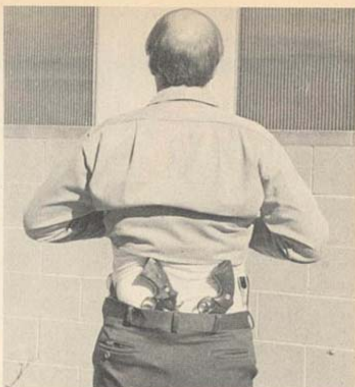
Three-picture series shows seven pistols in waistband. (Ref: airline story)