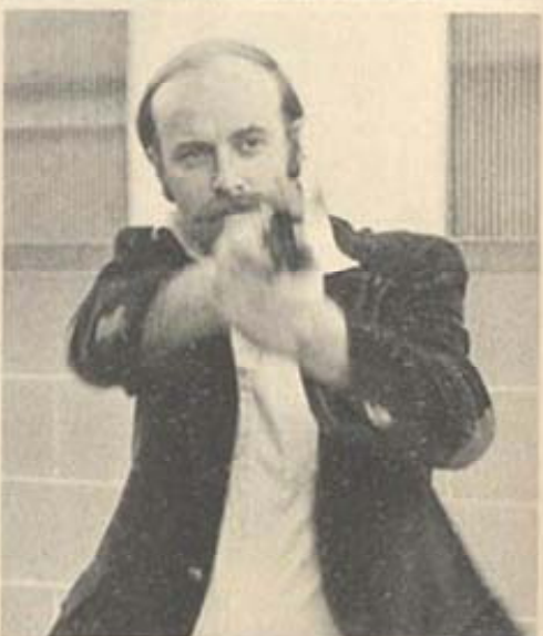
6½-inch S&W .44 Magnum is very fast out of Milt Sparks shoulder holster.