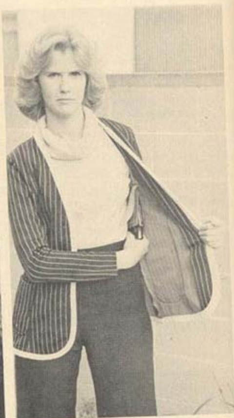
Shoulder holster for women is sometimes a necessary choice due to women's clothes seldom allowing a belt to be worn.