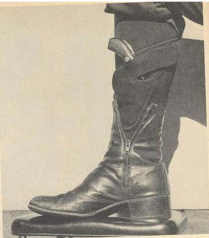
This is the Safariland ankle holster commonly called the "wet suit leg". It is extremely comfortable for an ankle holster and very secure. It doesn't wobble while running. It is most concealable when worn with the pistol on the inside of the leg, butt forward.