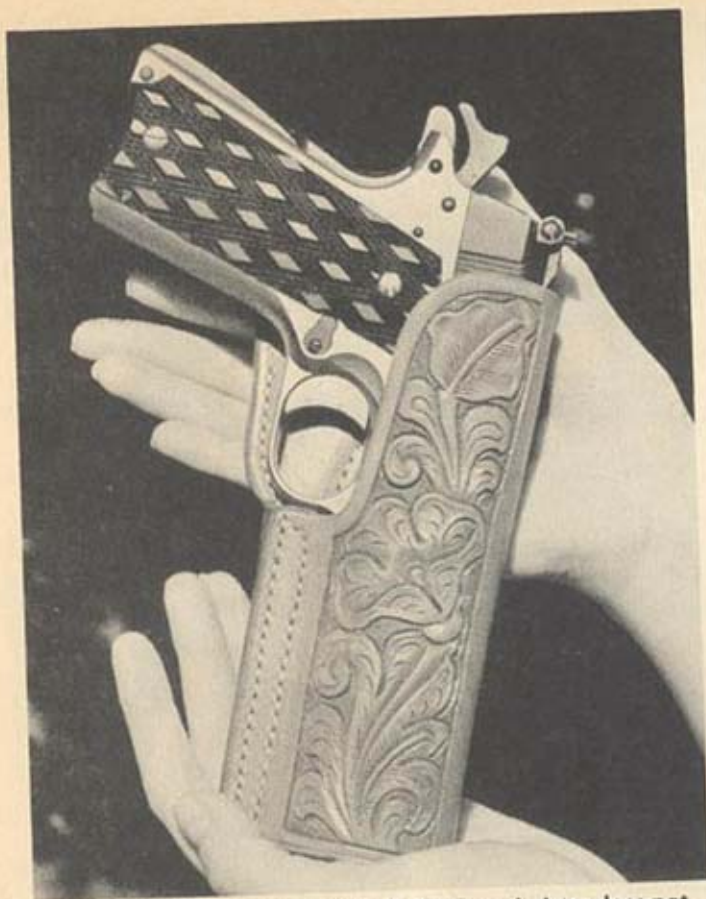
Exposed trigger guard of the S.D. Myers holster does not increase speed but offers potential hazard. There is no good reason for uncovering trigger guard.