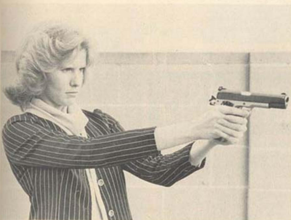
Proper Weaver Stance handles 90% of combat situations.

ried aboard to be worn! After negotiating on this point until minutes before departure and deciding against checking them as luggage, knowing the theft rate, I borrowed a private office and slipped all six into my waistband along with the Colt Commander I was already wearing. I then "clanked" my way on to the aircraft past 180 passengers with all seven weapons covered by only a "square-cut" sportshirt worn "untucked." No one looked twice. So much for worries about concealment! Concern for proper concealment