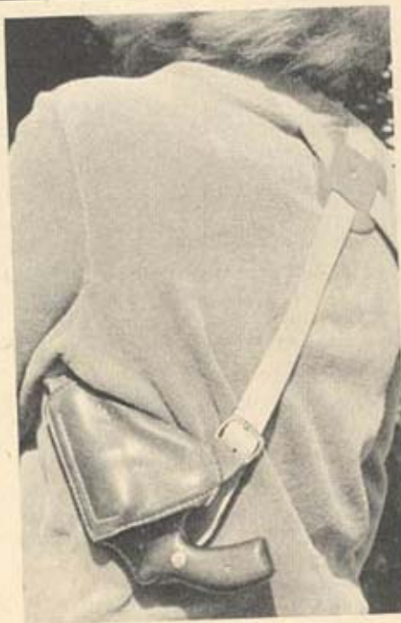
Upside-down "Berns-Martin" style shoulder holster shifts to rear during wear, makes draw difficult.

Assuming you have managed to avoid the "firing grip" problem you may wonder just how well your concealment holster conceals. The tendency of the inexperienced person is to be more concerned about the degree of concealment than usually proves necessary. This was demonstrated to me in a very unique way a few years ago. After having flown to a Northern California city on a commercial airliner carrying six pistols in a brief case, I arrived back at the airport a couple days later after teaching a law enforcement firearms class. The security agent informed me that although he understood that I had carried the pistols on the plane two days prior, policy now forced weapons car-